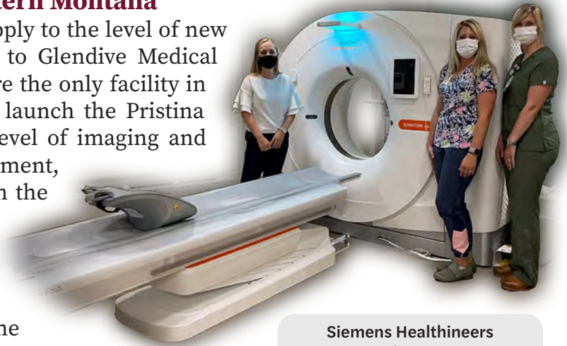
Siemens Healthineers SOMATOM® go CT Scanner

“Go big or go home” is a phrase that could apply to the level of new diagnostic equipment that has been added to Glendive Medical Center in the past few years. In 2018, we were the only facility in the country besides Boca Raton, Florida to launch the Pristina 3-D Mammography Suite with the highest level of imaging and low dose of radiation. Thanks to this equipment, we have detected aggressive breast cancer in the earliest stages. We have also added a new Fluoroscopy for our Speech Language Therapy to benefit many patients including those who have suffered from strokes. Our