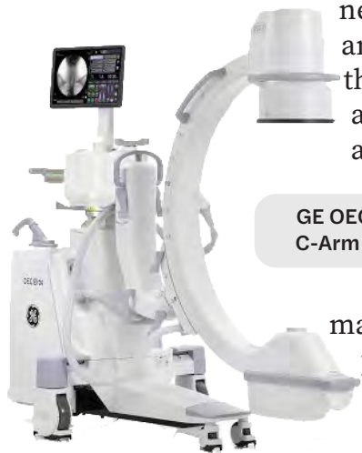
GE OEC Elite C-Arm X-Ray

new MRI machine and building were added in the Fall of 2020 with more space and comfort for patients. We recently obtained a brand new CT Scanner and 4-D ultrasounds that provide the ultimate in diagnosis and treatment